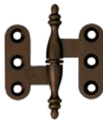
473 BA (57x65)