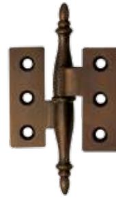
473 BIS (48x66)